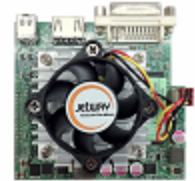
ADE4HV13M NVIDIA 610M GPU