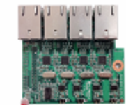
ADE4RTL LANG 4-port Realtek LAN