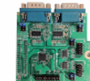
ADE4COMCB 4-port RS232 Serial