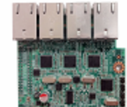
ADE4INLANG 4-port Intel LAN